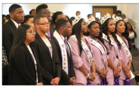
In a special 2023 Homecoming event to celebrate their historic academic achievements on Friday, Nov. 3, Wiley College announced the institution is set to become Wiley University alongside the implementation of three new graduate programs.

The change from Wiley College into Wiley University will return the institution to its original name it used when the school was founded, and will introduce three newly created online-focused graduate programs.