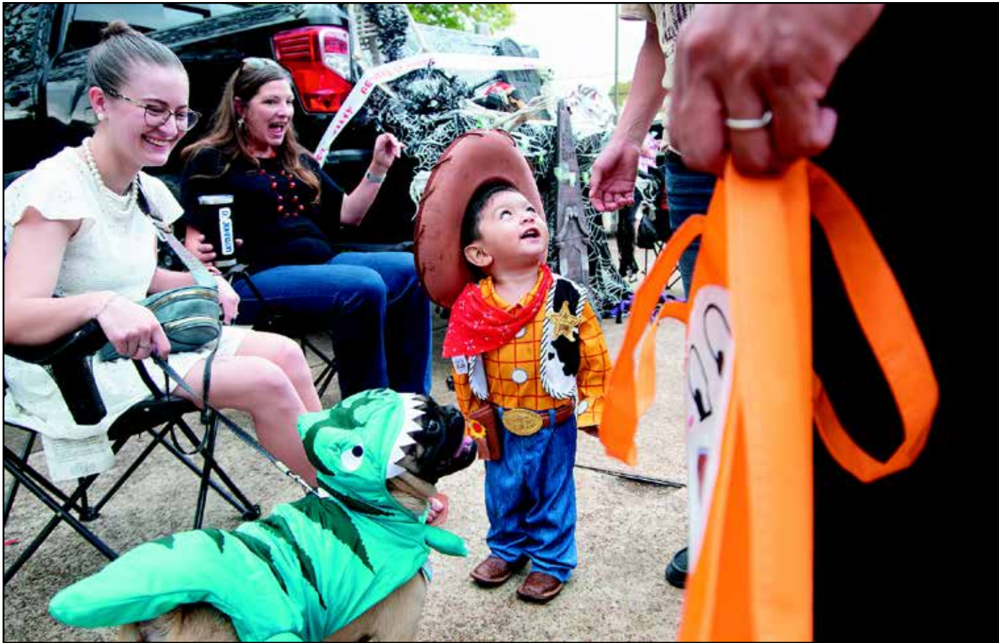
Div. 2 1st place Feature Photograph