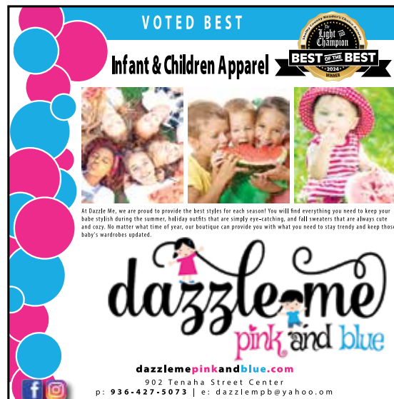
Light and Champion Div. 5 1st place Advertising