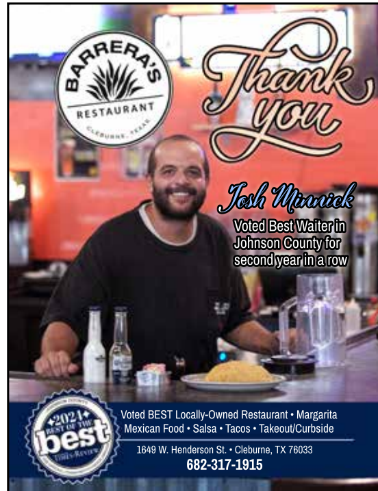
Cleburne Times-Review Div. 3 1st place Advertising